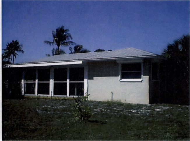
Rear Property Picture 4/6/2007