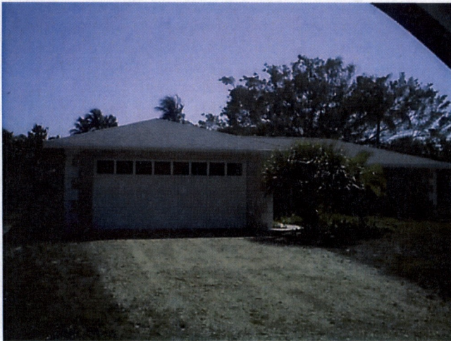
Front Property Picture 4/6/2007

If using the Elevation Certificate to obtain NFIP flood insurance, affix at least two building photographs below according to the instructions for Item A6. Identify all photographs with: date taken; "Front View" and "Rear View"; and, if required, "Right Side View" and "Left Side View." If submitting more photographs than will fit on this page, use the Continuation Page, following.