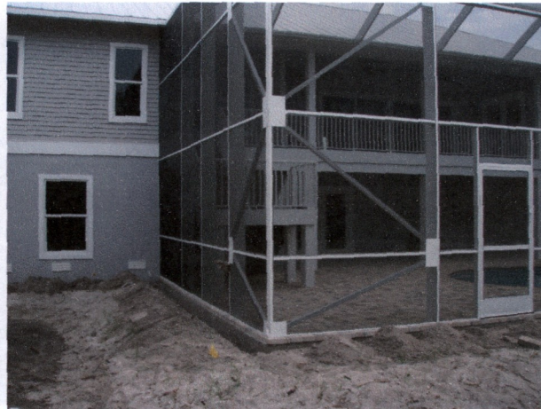
4/15/2009 REAR VIEW