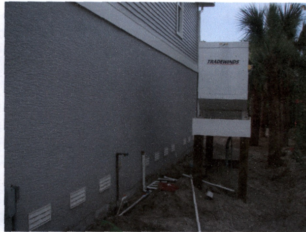
SIDE VIEW 4/15/2009