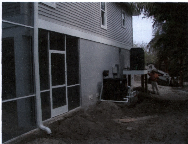
4/15/2009 SIDE VIEW