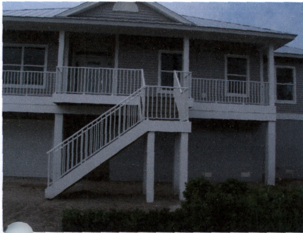
FRONT VIEW 4/15/2009