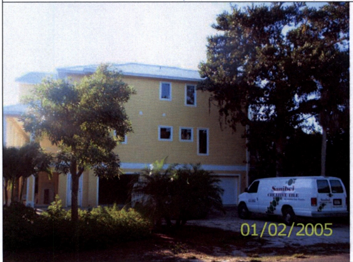
RIGHT SIDE VIEW(SEE COMMENTS)