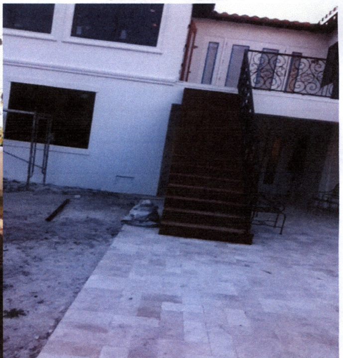
REAR VIEW 11/29/2012