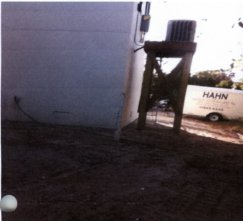
SIDE VIEW 11/29/2012