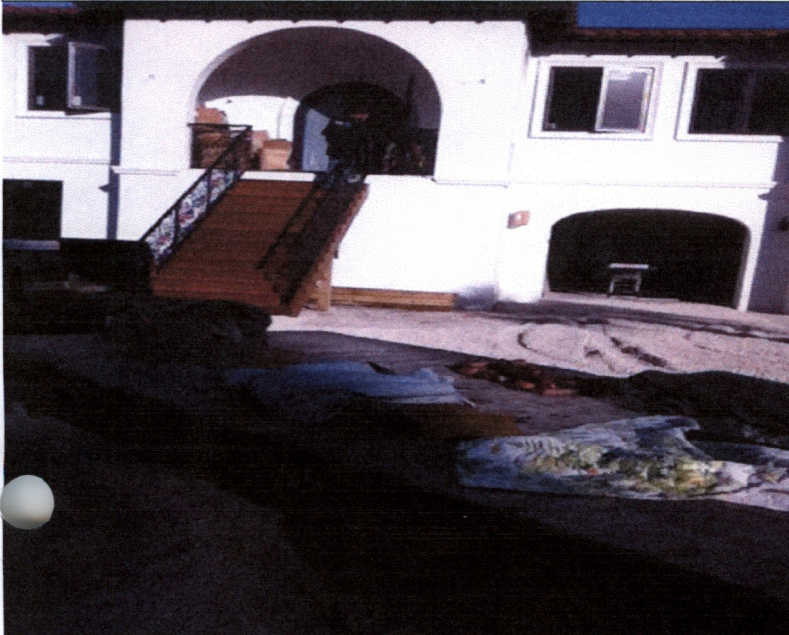
FRONT VIEW 11/29/2012

If using the Elevation Certificate to obtain NFIP flood insurance, affix at least two building photographs below according to the instructions for Item A6. Identify all photographs with: date taken; "Front View" and "Rear View"; and, if required, "Right Side View" and "Left Side View." If submitting more photographs than will fit on this page, use the Continuation Page, following.