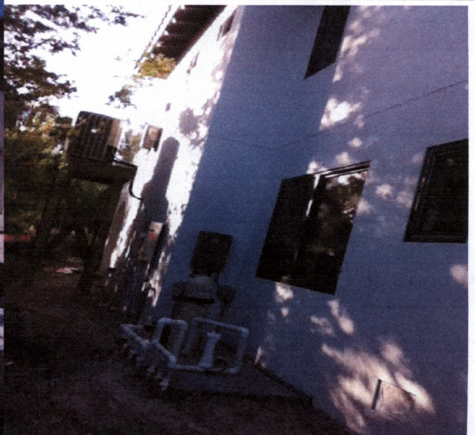
SIDE VIEW 11/29/2012