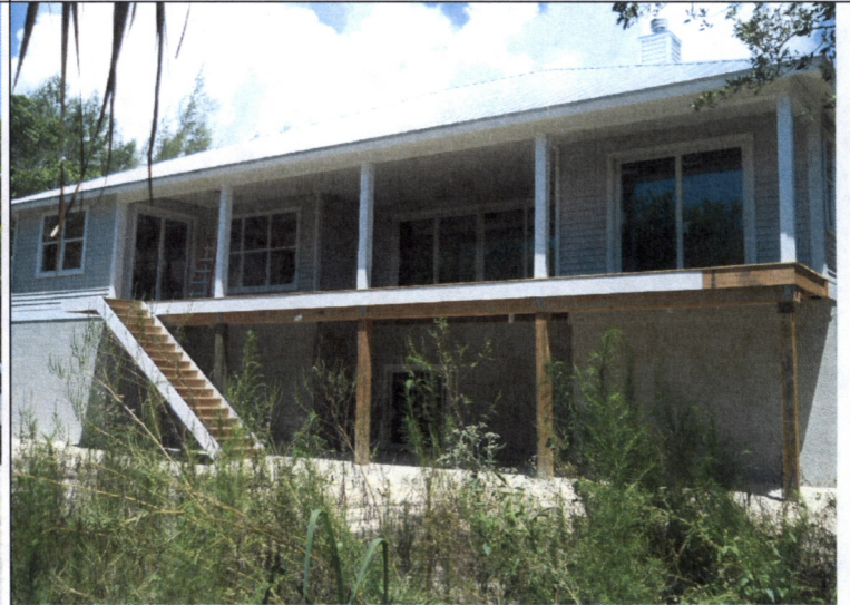
Left side view 7-30-2013