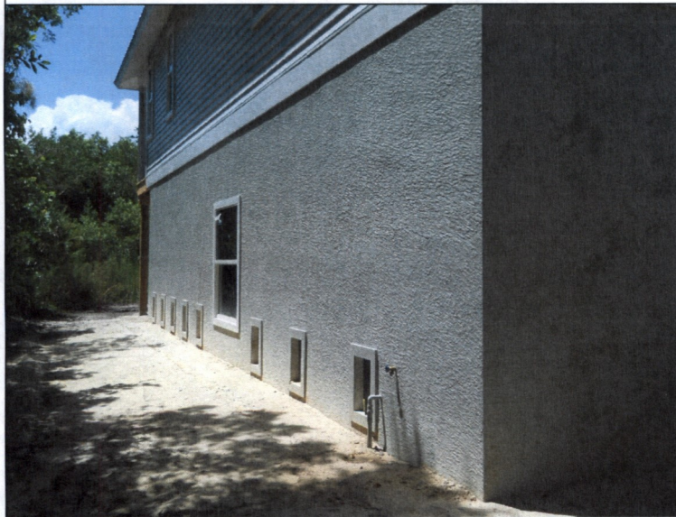
Right side view 7-30-2013