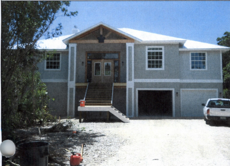
REAR VIEW 7-30-2013