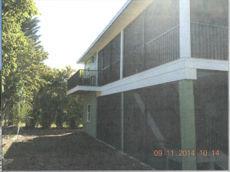
Rear View - 9/11/2014