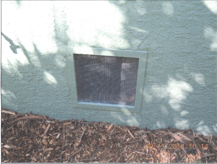
Permanent opening (typical)

If using the Elevation Certificate to obtain NFIP flood insurance, affix at least 2 building photographs below according to the instructions for Item A6. Identify all photographs with date taken; "Front View" and "Rear View"; and, if required, "Right Side View" and "Left Side View." When applicable, photographs must show the foundation with representative examples of the flood openings or vents, as indicated in Section A8. If submitting more photographs than will fit on this page, use the Continuation Page.