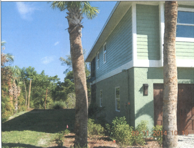
Left side view - 9/11/2014