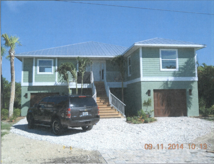
Front View - 9/11/2014