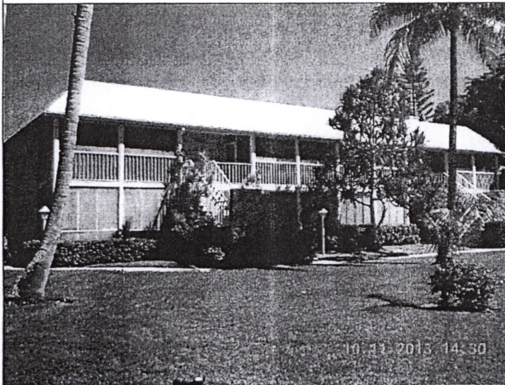
FRONT VIEW - 10/11/2013