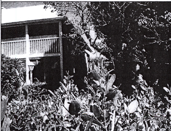
RIGHT SIDE VIEW - 10/11/2013